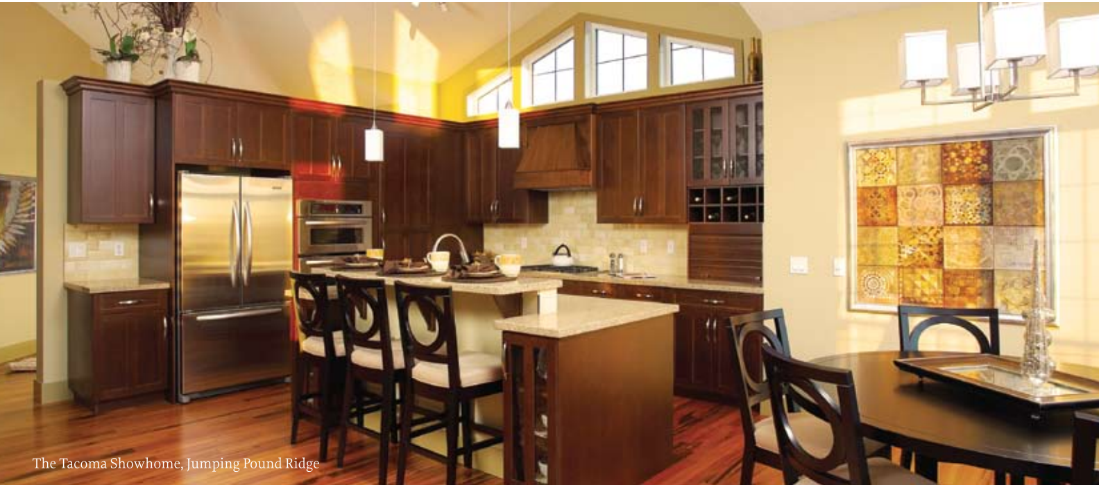
The Tacoma Showhome, Jumping Pound Ridge

almost There's nothing like a Brand New Home.